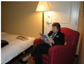
Relaxing in the suite with the newspaper which is delivered daily. The bed folds up into the wall for more space.