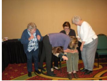
Fun and games night. Can you guess what kind of machine this is?