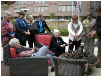
More of the courtyard. It is a beautiful place to relax.